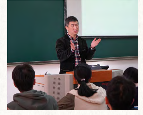
Professor fi Zheng

In September 2019, most freshmen at ECNU were ready to embark<sup>1</sup> on a new platform for college English. The approximately 3,000 non-English majors were going to take a different approach to the course on English Listening and Speaking for Academic Purpose (ESLAP), which combined classroom teaching and online learning from Zhihuishu (literally means the "Tree of Wisdom").